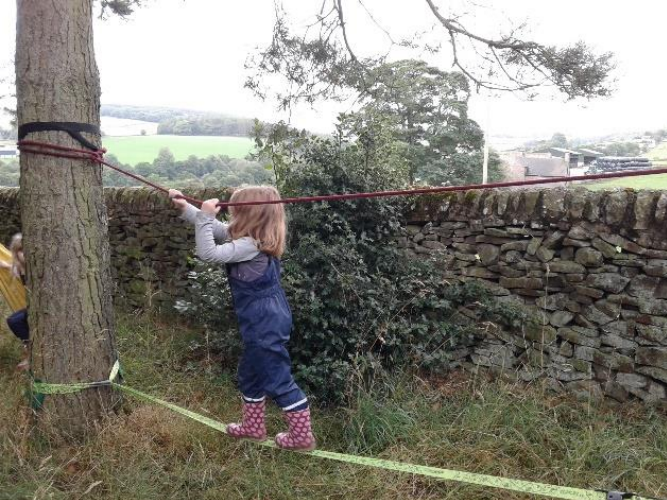
Balancing on a slackline at Longnor's Breathing Space