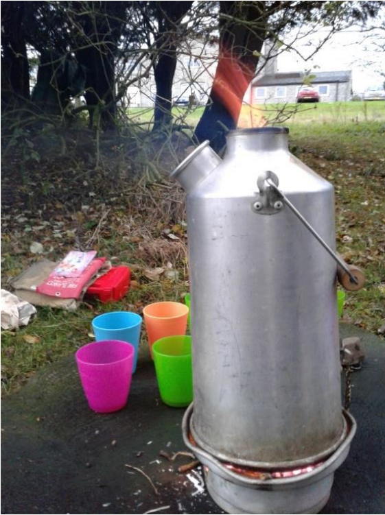
Learning how to use Kelly Kettles at the Manifold Academy, Warslow