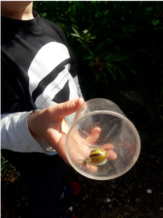
Bug hunting at the Pavilion Gardens, Buxton