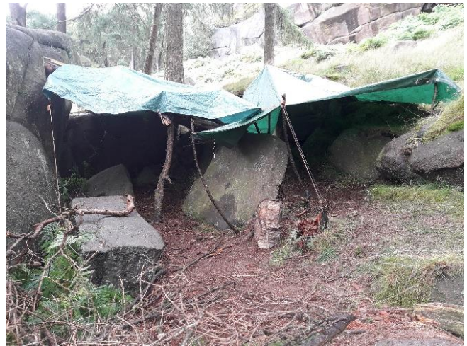
Den building at The Roaches