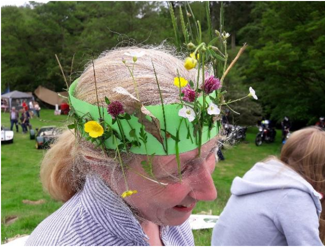
Nature crowns at Wincle Fete