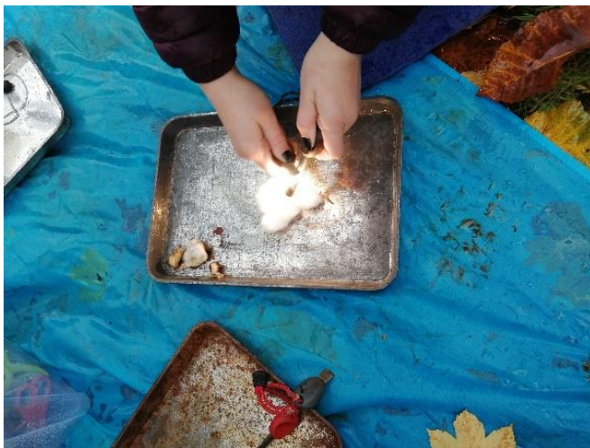
Fire lighting at Gradbach Mill