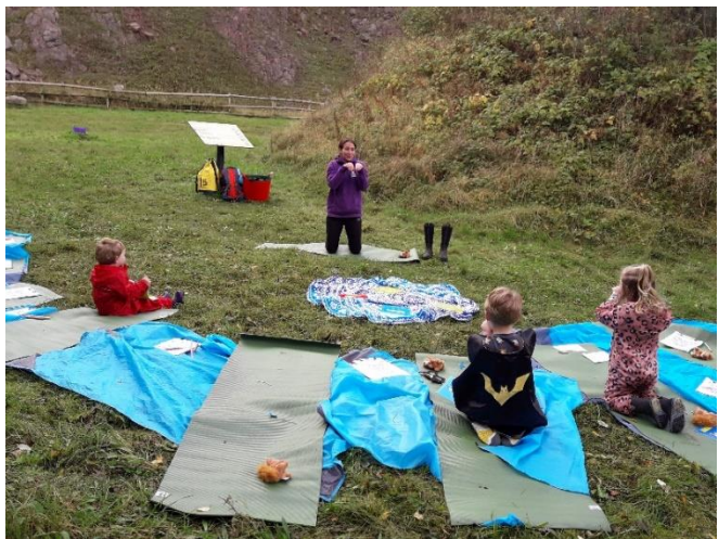
Yoga Squirrels at Brown End Quarry