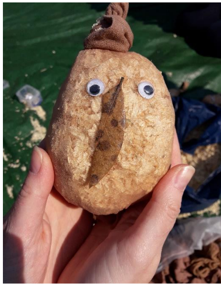
Natural crafts and bird feeder making at The Roaches and Gradbach Mill