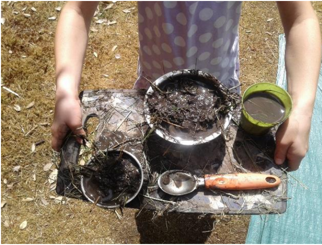
Mud kitchen creations at Macclesfield Forest