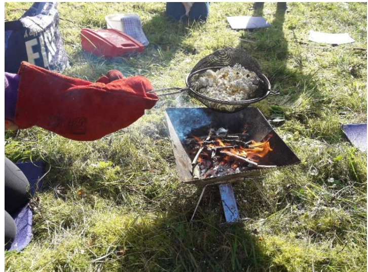
Campfire cooking at Brown End Quarry