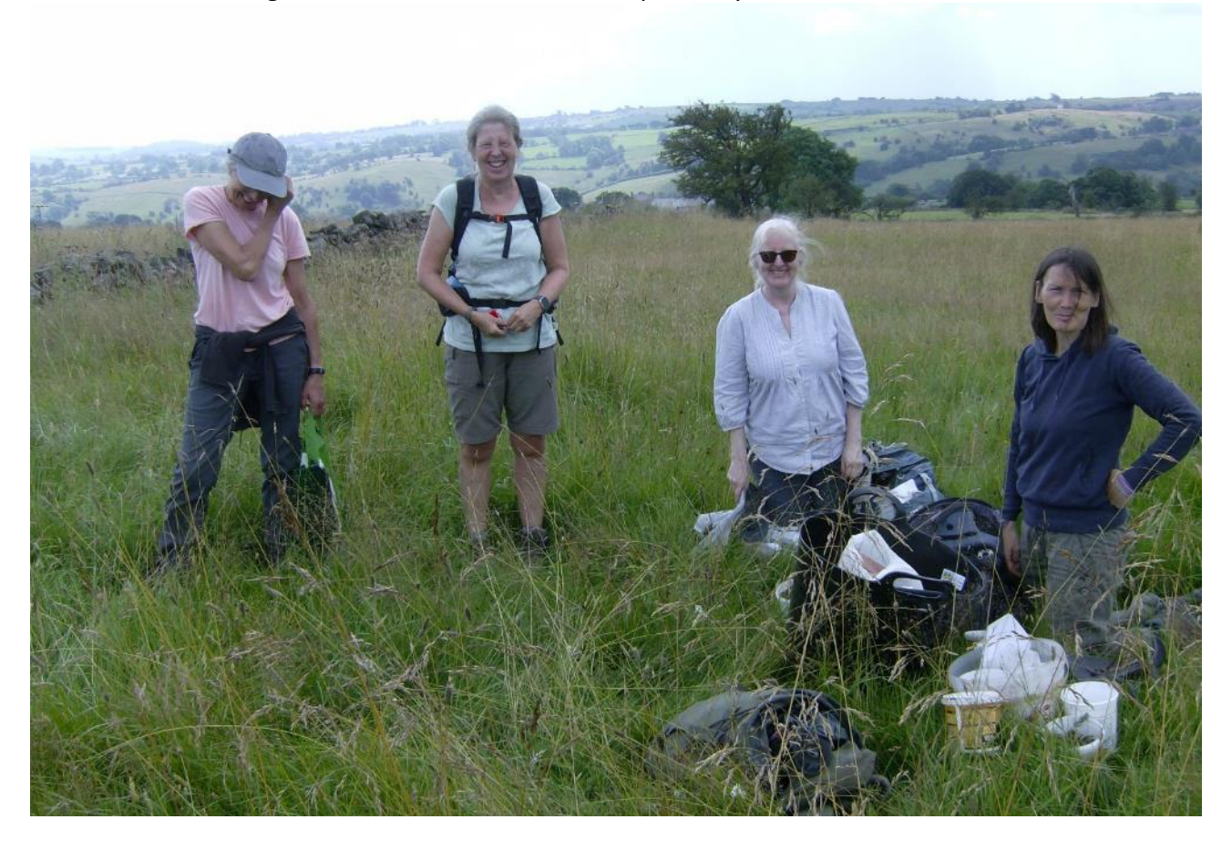
Volunteers transporting seed 2021